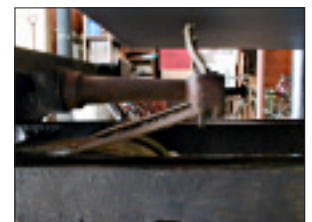
FIGURE 8A: A close-up view of the platen, bed, rounce barrel, rounce straps and ribs.