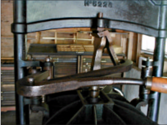
FIGURE 1: A frontal view of frame head, columns, platen braces, suspending-rod braces, springs, spring nuts, pressure wedge with threaded rod, coupling rod, bar, bar braces and bar handle.

13 Maple Street • Windsor, Vermont 05089 • USA