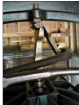
FIGURE 5: A view of the head, bar, toggle cap, standard, toggle lever, platen cup and platen braces.