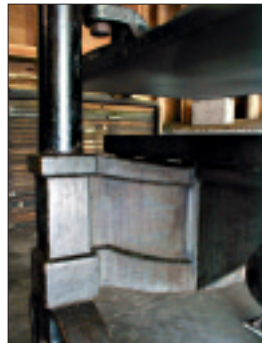
FIGURE 4: A view of the cheek, winter & winter flange and leg.