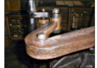
FIGURE 2A: A close-up of the column, suspending rod with collar, suspending-rod brace, spring, spring nut, pressure wedge with threaded rod, coupling rod, bar and bar brace.