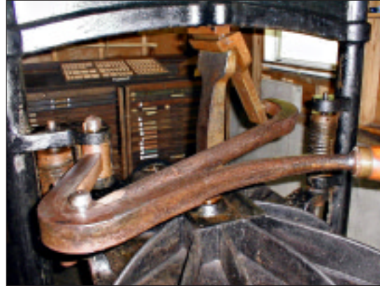
FIGURE 2: A close-up frontal view of frame head, columns, platen braces, tills, suspending-rod braces, springs, spring nuts, pressure wedge with threaded rod, coupling rod, bar, bar braces and bar handle.