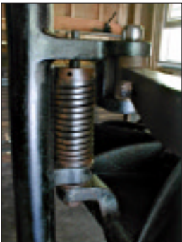
FIGURE 3: A view of the suspending-rod braces, springs and spring nuts.