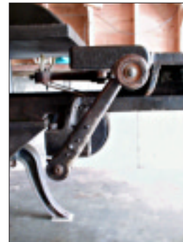
FIGURE 6: A view of the leg, winter flange, platen, platen brace, bed, bed brace, corner iron, rib, rounce, rounce barrel and rounce handle.