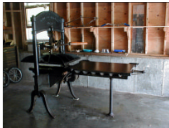
FIGURE 8: A complete sideview of a No. 5 R. Hoe & Co. Washington iron handpress with the serial number 5226 without tympan|frisket mechanism.